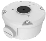
TR-JB05-B-IN Junction Box